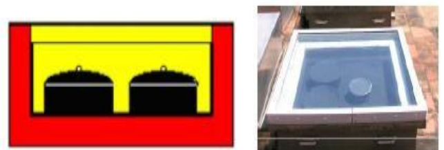
Fig-3: Box type Solar Cooker.

The most popular and affordable variety of solar cookers is the box type. These inexpensive box cookers have a very basic design that primarily consists of a black-painted metallic trapezoidal tray (cooking tray) that is typically covered by a double glass window. It is protected by a metal or fiber-glass exterior casing, and insulation like glass wool is placed between the cooking tray and outside casing. The cooking tray and the blackened cooking pots are hit by the solar radiation when it strikes the double glass lid. While the glass covers transmit short-wavelength radiation, which makes up the majority of the sun spectrum, they are practically opaque to low-temperature radiation that is emitted inside the box. As a result, the box's temperature increases until a balance between the heat lost through exposed surfaces and the heat gained through glazing is reached (greenhouse effect). Additionally, to increase the amount of solar radiation hitting the aperture, a plane reflecting mirror (booster mirror) of almost the same size as the aperture area is utilized. The bottom and sides of the cooking tray are insulated. Cooking is facilitated by the heat being absorbed by the blackened surface and being transferred to the food inside the pots. The many solar cooker types are displayed in Figure 3.