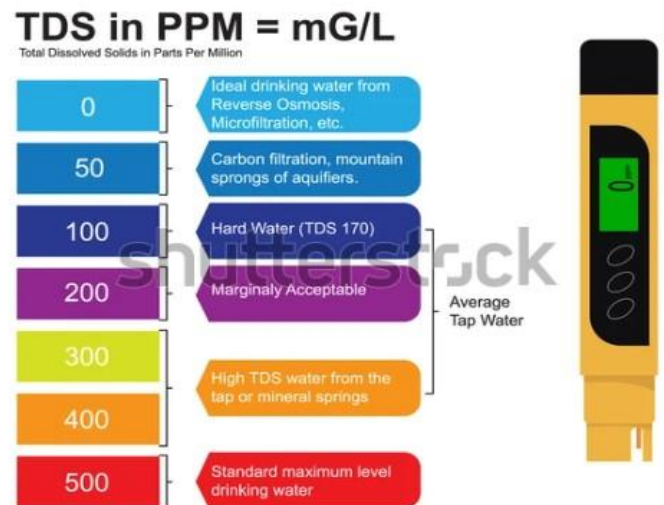
Table -1: TDS value table

4) Data collection: The water flow rate from the tank surface is measured in litres per hour by sensors installed in each overhead tank. The sensors in each overhead tank are set up to collect data from sensors and save it in CSV format. The data is published in the following format: "pH", "ppm", "C".