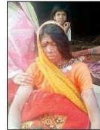
Injured tribal woman in Sagar

"I was only 25 feet away from the spot where the monster came crashing from the sky. Children and villagers witnessed the fall and then heard screams. We ran towards Rajrani house