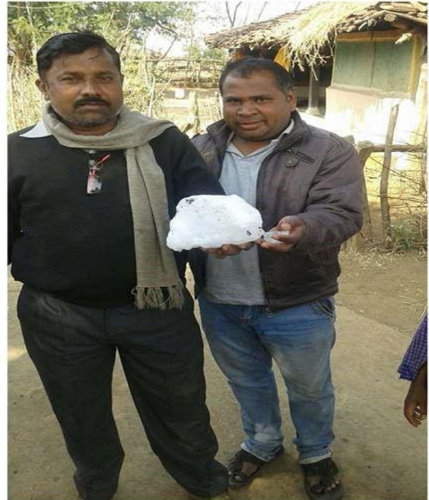
Ice Piece which fell from sky in MP (India) on 17th Dec 2015 causing injury to an old woman.

fact, the block of ice, also known as "Blue ice" or "Aircraft Ice" is a mixture of human bio-waste and liquid disinfectant that freezes at high altitudes.