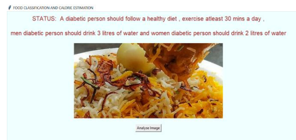
Fig-3: Food Classification