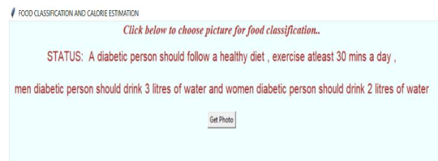
Fig-2: Food Classification

This research also benefits diabetes people and suggests a healthy lifestyle by recommending whether the food can be consumed by diabetic patients.