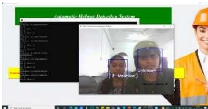
Fig 5. Helmet Detection Page