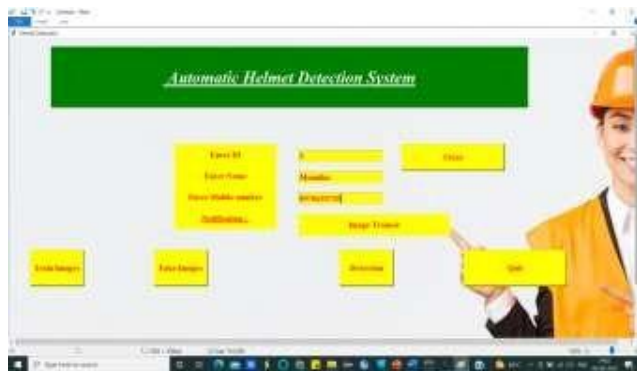
Fig 4. Labor Registration Page

Several prior related studies were used to evaluate the performance of the proposed systems. The accuracy ranges of the previous research are between 96.8 percent and 66.3 percent.