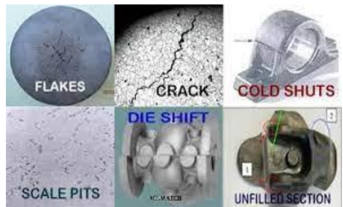
Fig.2 Forging Defects.

Remedies: It can be prevented by slow cooling of the forged parts.