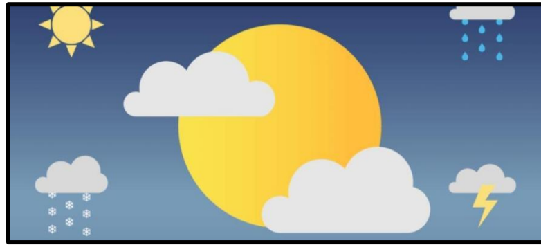
Figure 1: scattered clouds and partly cloudy