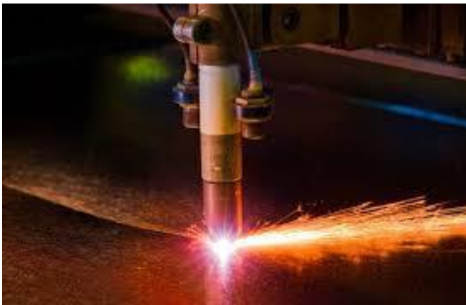
Figure-2: CO2 Laser.