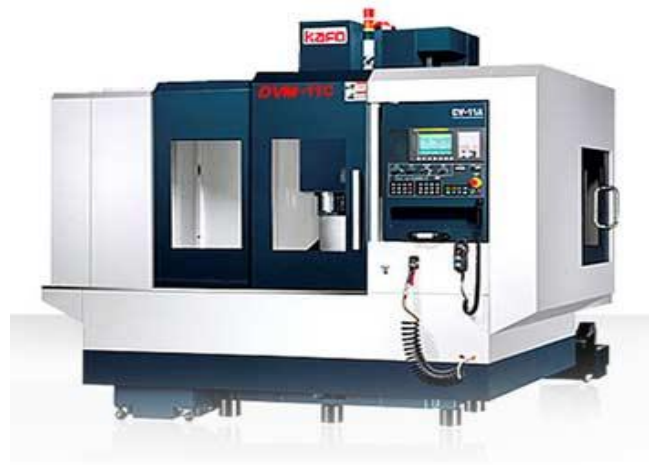
Figure-1: CNC Machine.

solitary arrangement of guidelines. This is the figure of the CNC machine: