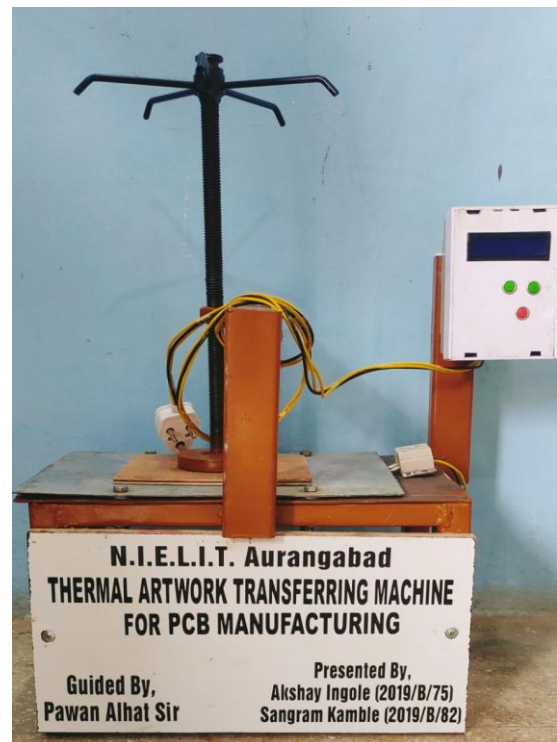
Fig.2: Project Model