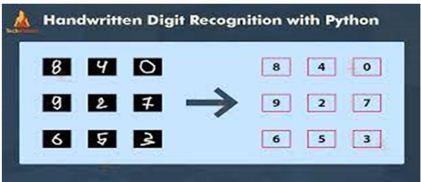
"Figure2: Handwritten Digits converted to Machine Understandable Language"

"The comparison of the algorithms( Support vector machines,Multi-layered perceptron and Convolutional neural" "network) is grounded on the characteristic map of each algorithm on common grounds like dataset, the number of" "ages, complexity of the algorithm, delicacy of each algorithm, specification of the device( Ubuntu20.04 LTS, i5 7 th " "word processor) used to execute the program and runtime of the algorithm, under ideal condition[7]."