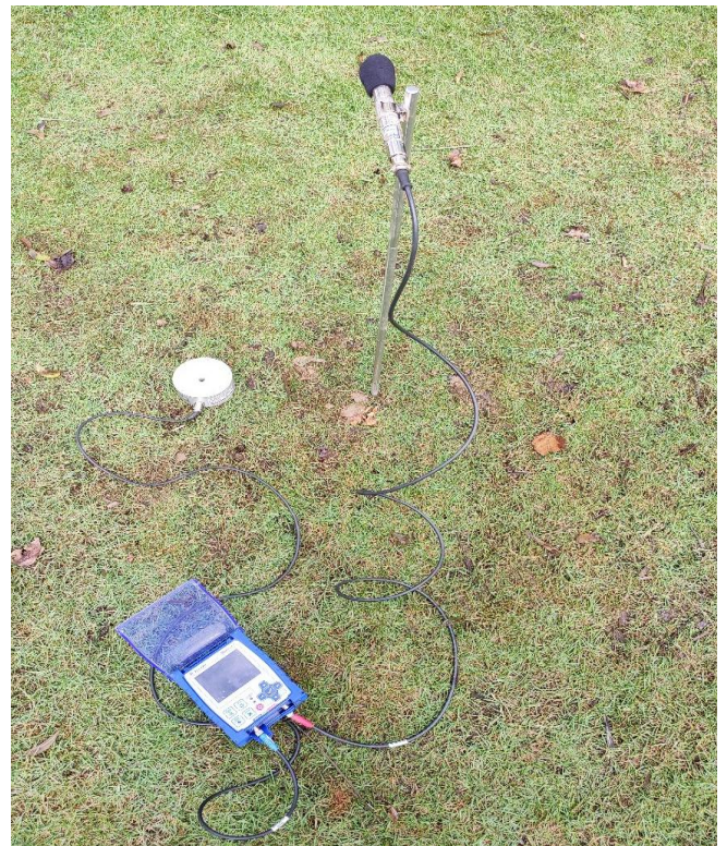
Figure 4: Vibration and Noise monitoring device

During the blasting operation the vibration and noise levels were monitored with a special equipment called minimate and it is depicted in Figure 4. This equipment is connected with the two kinds of sensors namely, geophone and microphone which are capable of sensing the vibration and noise levels and they are depicted in Figures 5 & 6. During the blasting operation the instrument was installed at a distance of 300 meters from blast site and the vibration and noise levels are noted.