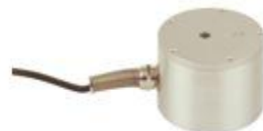
Figure 5: Geophone