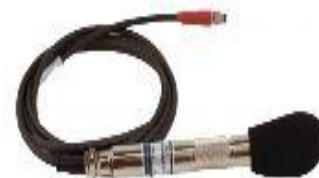
Figure 6: Microphone

There are various blasting parameters on which the blast result depends. The blast parameters used at the study site are shown in the Table1.