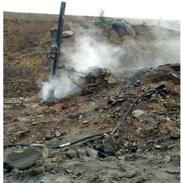
Figure 1: Drilling machine at study site

for the construction industry to use as raw material in building and road constructions. In the study site for carrying blasting, first the holes are drilled with the help of drilling machines which are operated with the help of pneumatic power, the drilling machined used at the site was depicted in the Figure 1.