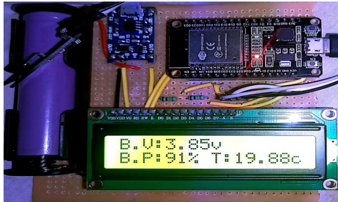
Application data readings