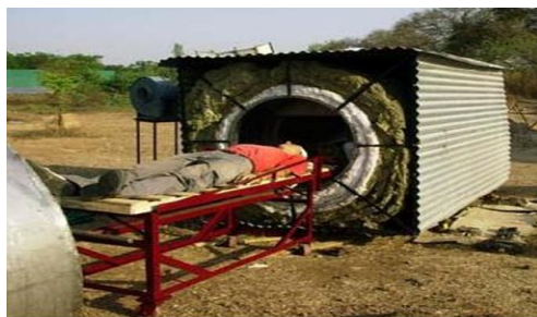
Fig - 5 : Dead body in Crematorium

As quickly because the platform is ready, the chamber may be tested. If the temperature in the chamber is achieving eight hundred diploma Celsius, then 1 animals which are small like e.g. lifeless bodies of puppies may be cremated with the experiment that it can be used for the cremation of humans and no problem will occur during it. as in india as it is a ritual to cremate bodies thus no problem should occur while the rituals are happening so that noones emotions are hurt.