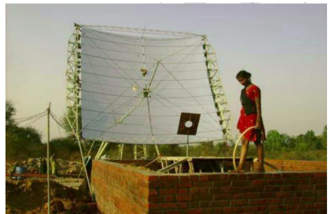
Fig - 2 : Concrete Reinforced Foundation Platform 6.3 X 9 m 2 under construction Where chamber will be placed

principle undertaking is to make a completely small focal area, the complete body needs to be adjustable for precise positioning at some stage in the special seasons of the year. Electrical DC vehicles with gearboxes ought to be set up and examined for an stepped forward seasonal adjustment . All the elements ought to grow to be very specific for you to have minimal errors withinside the focal area.