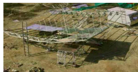
Fig - 3: view of the cross bar stand

The region near the river is preferred because of the brand-new crematorium. Accurate North-South alignment is marked so we are able to integrate the legal formats into this sub-area. Sight should be round 240mm wide but in the morning and at night when the body is twisted which eventually becomes more visible. The stand, rotating guide and body wings and small parts were given sand and the primer was changed twice as a spray to prevent decay. Finally the demonstration was held at a brand new suspension site (income season in rural areas). Body parts are established on the ground rotating guide. Immediately due to the concrete being reinforced, the stand and back-crane stand (lifting up and down stairs) are erected with the help of a mobile crane. . The precise alignment of the stand (bears corresponding to the polar axis) has changed to a correction. During the various stages of the actual school performance are integrated which allows you to enable the operator to use the gadget efficiently. After the mirrors were all set up in the body bags (see Figure: 3) we also needed a crane to lift the finished body..