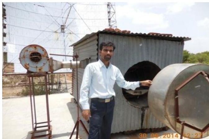
Fig. 6 : Solar Crematorium at Goraj village

Examination of small portions of meat regarded hopeful. However, Ashram will now no longer be capable of installation a sun mobileular to be used until