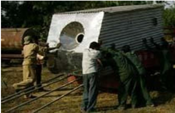
Fig- 4 : Chamber (front) arrives.

moment. As mentioned within the summary, the focus area is 240 mm wide. To be able to twist precisely between morning and night mode, eight more than four twisted wires are connected to the four corners of the body by a flexible telescope column in the center of the body.