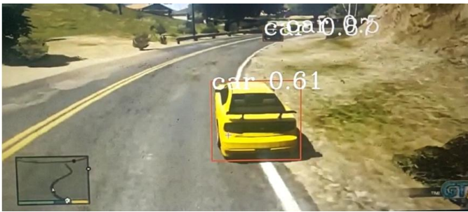
Figure 3 : Object Detection and precision