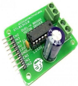
Fig 2.9 L293D Driver

The L293D is a 16-pin IC with 8 pins on both sides dedicated to motor control. Each motor has two INPUT pins, two OUTPUT pins, and one ENABLE pin. It receives signals from the Arduino and sends it to motor.