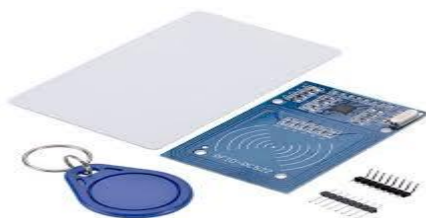
Fig 2.4 RFID Tag

RFID Tags are simple devices having a chip and an antenna that can be used to wirelessly identify the objects they are embedded in using an RFID reader. RFID tags, unlike barcodes, do not require line of sight between the tag and the reader and may read and write data.