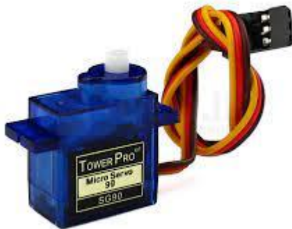
Fig 2.8 Servo motor

The length of the pulse applied to the control PIN of the servo motor controls the angle of rotation. Servo motors are DC motors with variable resistors (potentiometers) and gearboxes. The main advantage of using servos is that they provide angular accuracy. That is, it only rotates as much as it needs before stopping and waiting for the next input. Servomotors are linear or rotary actuators that can accurately control linear or angular position, acceleration, and velocity. It consists of a motor with a position feedback sensor. You also need to use advanced controls.