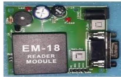
Fig 2.5 RFID Reader

An RFID reader is a device that collects data from an RFID tag, which is used to track particular things. Data is transmitted from the tag to the reader using radio waves. RFID (radio frequency identification) is a technology that works similarly to bar codes in theory.