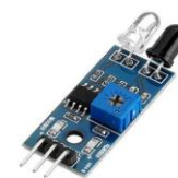
Fig 2.7 IR Sensors

An infrared sensor (IR sensor) is a radiation-sensitive optoelectronic component with spectral sensitivity in the infrared wavelength range of 780 nm...50 um. IR sensors are widely used in motion detectors today