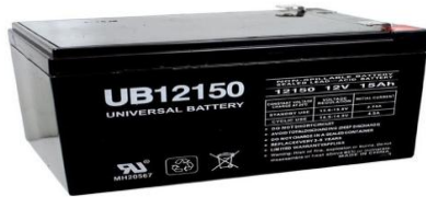
Fig 2.2 Lead Acid Battery

A lead acid battery is a type of rechargeable battery that uses chemical reactions between lead, water, and sulfuric acid to store electrical energy. Lead acid batteries are a solid option for storing energy generated by a solar array.