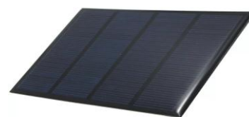
Fig 2.1 Solar panel