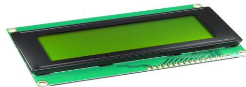
Fig 2.6 LCD Display

LCD (Liquid Crystal Display) is a type of flat panel display that uses liquid crystal in its main mode of operation. LEDs have a variety of consumer and business use cases, as are often found in smartphones, televisions, computer monitors and instrument panels