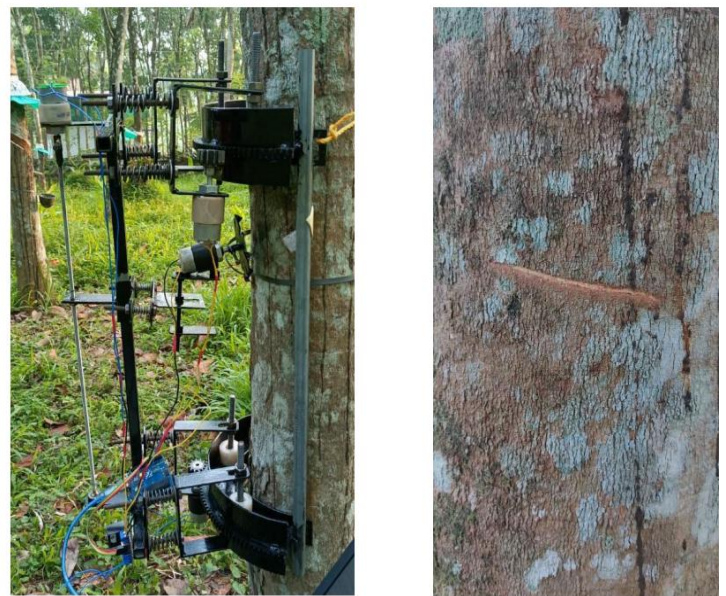
Fig -3: Automatic Rubber tapping system & Tapped pattern

The fig-3 shows the incision made by the cutting blade on the tree surface. The incision is made on the tree surface through the rotation of the cutting blade on the tree surface. The cutting mechanism consist of a suspension system which presses the blade towards the tree surface thus providing a sufficient force for peeling the bark. Through this mechanism, the device will make an incision at a depth of about 3mm on the bark of the tree.