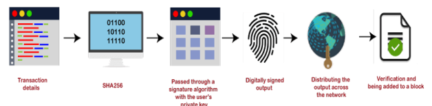
[4] Bitcoin Transaction