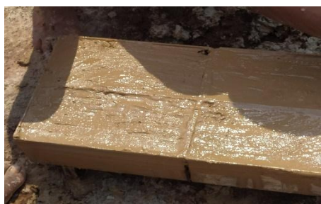
Fig – 2: Moulding

about belt conveyor to feed in to automatic brick making system where the bricks are pressed automatically. Then the bricks are positioned on wood pallets and set aside as it's far for two days, there once they are water cured for 10 -15 days. The bricks are looked after and examined at 7 th and 14 th from the day of manufacturing, every brick has been casted for nominal length of 190mm×190mm×90mm.