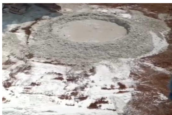
Fig - 1: Mixing of Material