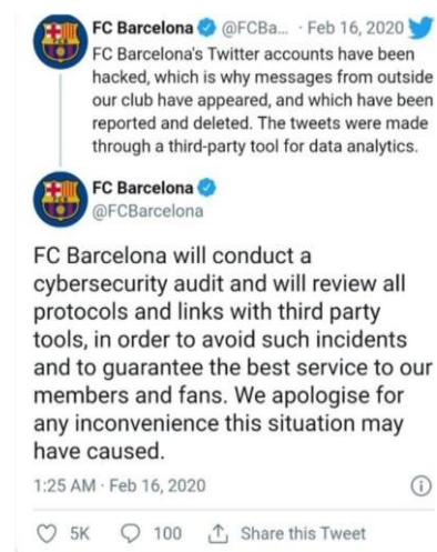
Fig -2: Twitter tweet hack example

It's fantastic to be able to secure your own social media accounts. However, flaws in linked third-party applications may allow hackers to obtain access to protected social media. Hackers gained access to the International Olympic Committee's Twitter accounts. They gained access through a third-party analytics tool. The similar hack happened to FC Barcelona [3].