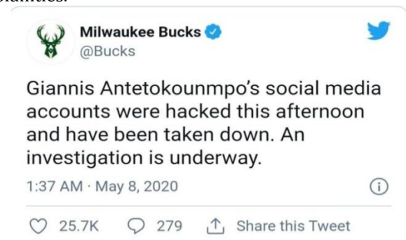
Fig -3: Twitter Accounts Malware Attack

Hackers who obtain access to your social media accounts might severely harm your brand's reputation. Hackers allegedly acquired access to NBA MVP Giannis Antetokounmpo's accounts. His crew had to undertake damage control when they tweeted racist insults and other profanities.