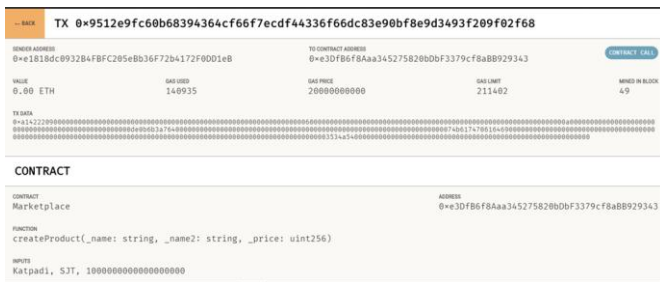
Fig -4: Snapshot of the transaction details when Block 49 was created

This is the transaction (Fig-4) created when the user put up the ride for sharing. The sender's address, gas value, gas limit, etc. are listed in the transaction. It also has the data of the transaction and other details related to the contract deployed.