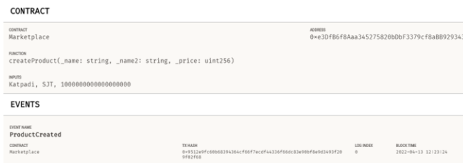
Fig -5: Details of the smart contract stored on the Block

This is the transaction (Fig-4) created when the user put up the ride for sharing. The sender's address, gas value, gas limit, etc. are listed in the transaction. It also has the data of the transaction and other details related to the contract deployed.