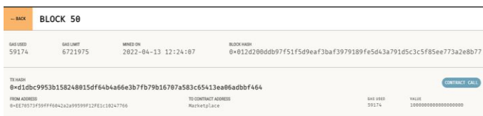
Fig -6: Block mined when the user is sharing the ride

As we can see in the above figure (Fig -5), here the details sent by the user are stored. The to and from address along with price is stored and that's how the data is being stored on the blockchain.