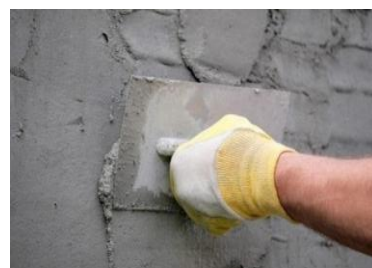
Fig 1.2 Finishing Mortar

Finishing mortar is used for pointing and plastering works. For general type of plastering cement or lime mortar is used. Finishing mortar is also used for architectural effects of building to give aesthetic appearances. The mortar secondhand for ornamental finishing's must take great strength, flexibility and resistance against atmospheric action like rain, wind, etc.