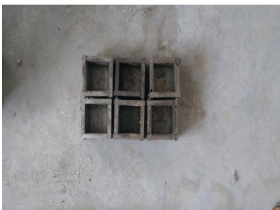
Fig-2 Moulds of size 70.6x70.6x70.6