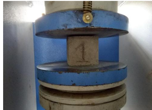
Fig-3 Compressive testing of mortar cube