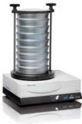
Fig -1: Apparatus for sieve analysis