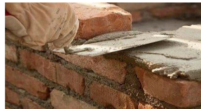
Fig 1.1 Bricklaying or Pebble Laying Mortar

Normally, in masonry stockades the structural items such as stones or else bricks stand bonded composed by using mortar. The scopes of elements for this determination are decided through respect towards the kind of mandatory substantial used.