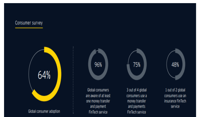
Fig 3.1. Global Consumption Adaption

Small Businesses & Entrepreneurs, Fintech has been a watershed moment for entrepreneurs and small business owners. For most start-ups, obtaining a loan from a traditional banking institution is challenging. Fintech, on the other hand, has made a difference. Fintech allows SMEs to obtain loans and process payments. Small businesses, which have been viewed as high-risk in the past, are one of the major areas where Fintech has had the most impact in terms of reforming and developing..