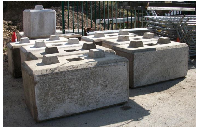
Fig -1: Lego Cement Blocks

the blocks. Waste is created in large quantities all around the globe.