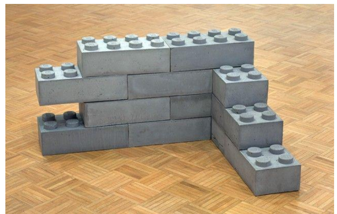
Fig -2: Lego Cement Blocks

Various varieties of interconnecting blocks and brick have been manufactured in recent years, with substantial composition, dimensions, and form altering according on the needed strong point and use."Sparlock systems, Meccano scheme, Sparfil system, Haener scheme, Putra block arrangement, and the Solid Interlock block (SIB) or else Hydraform blocks" are examples of these alternatives to traditional bricks and blocks. "Soil-cement blocks, rice quiet ash concrete blocks, and concrete blocks" are among the numerous interlocking blocks depending on materials, according to reports. The cement-to-soil ratio in soil cement blocks is normally flanked by 1:6 too 1:10 by volume, but in rice hush ash (RHA) masonry, the cement-to-rice hush ashes proportion is 1:4. In addition, the proportion of cement, sand, and gravel in the concrete blocks is 1:5:3. [15]