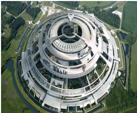
Fig -3: Circular Shape Building without Courtyard

In the above figure you can see there is no open space inside the circular building.