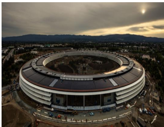
Fig -1: Circular Shape Building.

The primary notion behind adopting a circle shape building is that, as we all know, the aerodynamic impact of a circular shape building is smaller than that of other shapes. We give the circular shape at the top of the building to lessen the influence of the wind when we create a high-rise structure since the effect of the wind is large at the top of the building. The circular has several advantages, including lower embodied energy, increased energy efficiency, earthquake and wind resistance, and lower cost. The circular building's figure-1 is as follows: