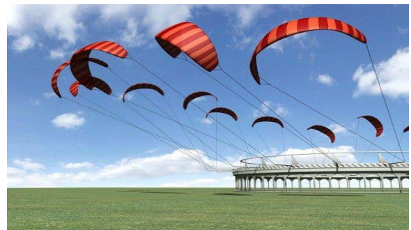
Fig : 1 sample view of energy kite

circular orbit, the energy created by the energy Kite on board is sent to ground via a high voltage wire implanted into the tethering material to the ground station.