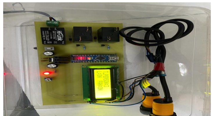
Figure 4 Developed model

The following are the obtained results of the bidirectional visitors counter. The model was successfully built and was easily portable as shown in Figure 5.