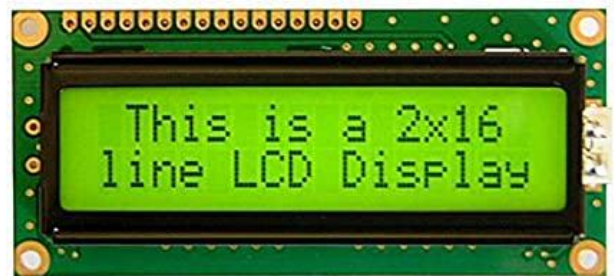
Figure 3 LCD Display

display is utilized frequently in numerous circuits and devices. A 16x2 LCD is capable of displaying 16 characters on each of two lines. Each character is displayed in a 5x7 pixel matrix on this LCD. 24 distinct characters and symbols can be displayed on the intelligent 16 x 2 dot matrix display. The Command and Data registers on this LCD are its two registers.