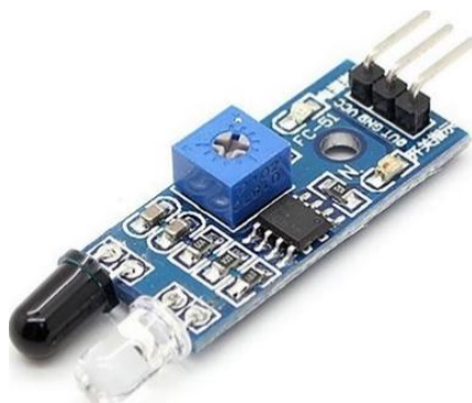
Figure 2 IR Sensor

The power supply stage supplies the necessary DC voltage to ensure that the circuit's components, particularly the Active ones, are powered appropriately. The supply for the circuit is +5VDC. Rectifier is a step-down transformer that is used in the linear power supply stage. The regulated DC voltage is provided by a filter capacitor and voltage regulators.