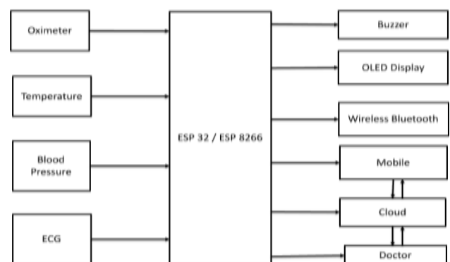
Fig -3: System Architecture