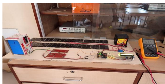
Fig-4: Actual Project Model Of Solar Roadways