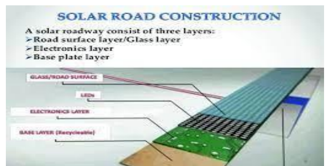
Fig-2: Solar Road Construction