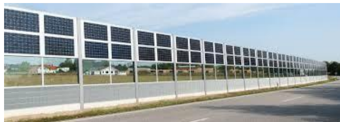
Fig-3: Solar Roadways

The solar panel on top of the divider stud's road receives solar energy from the sun, which can then be converted into electrical energy and stored electricity energy converted into light energy automatically. Solar Roadways' main goal is to generate clean renewable energy on roads and other surfaces that can be walked or driven on. Parking lots, walkways, roads, tarmacs, plazas, bike pathways, playgrounds, garden paths, pool surrounds, courtyards, and similar areas fall under this category. Solar energy has a long history of beneficial applications. The SR idea raises the bar for solar technology. The goal is to collect the significant solar energy that now falls on these surfaces but is not being used. They will serve a dual role in this way: contemporary infrastructure and a smart power grid. This also gives the solar business access to a whole new market.