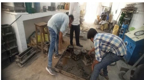
Fig 1: Preparation of cubes