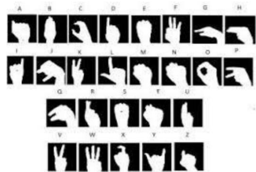
Fig 1: Sign Language for Alphabets A-Z

able to recognize Sign Language. American Sign Language was chosen since it is utilized by a majority of those disabled. We believe that it will benefit for deaf and dumb people by providing them a flexible translator. Sign Language Recognition System (SLR) utilize computer vision and machine learning method convolutional neural network (CNN).