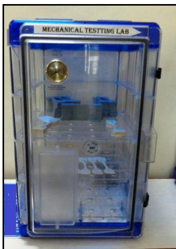
Fig.3 desiccators for conditioning rocasin sample

Samples prepared for mechanical testing is required to keep inside the desiccators in order to remove the moisture present in the Rocsin samples.