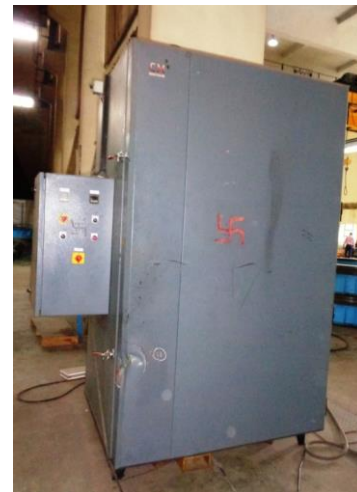
Fig.1 Hot air oven

It is planned to carry out the experiment by preparing the samples in two stages. The first stage comprises the preparation of the sample for heating inside the hot air oven. In the first stage, the size of the Rocasin rubber sheet will be selected for heating at a predefined set of temperatures for a given time period, and in the second stage, the sizing of samples will be carried out in order to meet the test standard while evaluating the mechanical properties. The hot air oven for heating the samples is shown in Fig. 1.