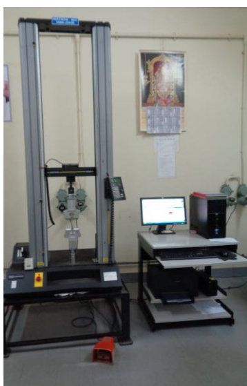
Fig.2 Experimental set up (UTM)