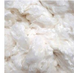
Fig -4 Bamboo fibre

structural elements like corset ribs and bustles, but presently due to technology advancements, bamboo fibre is used in a wide variety of fashion and textile applications [17,18].