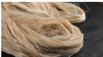
Fig -3: Banana fibre

Banana fibre is also called Musa fibre. It is one of the strongest natural fibres. It is biodegradable and is obtained from the banana tree's stem. It is known for its durability. It is composed of walled cell tissue that is thicker. These are merged by gums that are natural. Cellulose, lignin and hemicellulose are present in the fibre. The spin ability, tensile strength and fineness of banana fibre is comparatively better than natural bamboo fibre. Ropes, woven fabrics, handmade papers and mats are made using fibres of banana [16].