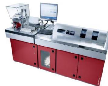
Fig -6 Uster HVI 100

The testing for organic cotton was carried out in SITRA-South India Textile Research Association. USTER HVI 1000 was used to identify the properties. This global reference tool is used for the classification of cotton and provides results that are reliable and more accurate. It only takes seconds to complete the test and requires only one operator. It immediately provides results on 11 essential quality characteristics such as strength, length, fineness, moisture content, the color of the fibre etc.