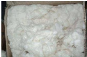
Fig -2: Organic cotton

Organic cotton is cultivated using materials and methods that are less harmful to the environment. The benefits of producing organically are to maintain and replenish the fertility of the soil, reduction in the usage of pesticides and fertilizers that are toxic and build an agriculture that is biologically diverse. The usage of poisonous pesticides and fertilizers are excluded in the cultivation of organic cotton. In organic farming, the usage of seeds that are engineered genetically is restricted under federal regulations. Organic cotton accounts for 0.7 per cent of the entire production of global cotton [15].