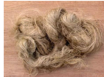
Fig -5 Castor oil fibre

Castor oil fibre is a biopolymer that is derived completely from castor beans. It is a textile fibre with high performance and innovation of natural origin. It is manufactured for castor oil seeds that are cultivated in the arid regions not apt for other varieties of agriculture. This biopolymer does not affect the human food chain in comparison with other polymers that are bio-based and use products segregated for the sector of food and agriculture. It is a 100% renewable resource which does not need a huge water quantity [19].