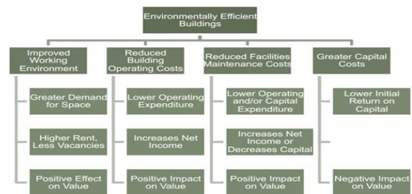
Figure 1: Value Impact of Environmentally Efficient Buildings

A study done by Boyd and Kimmet (2006), took a gander at the Triple Bottom Line (TBL) way to deal with the budgetary execution of speculation properties, concentrating particularly on ecological and social attributes of green structures. The likely effect of improved natural qualities on venture sort property is appeared in Figure 1.