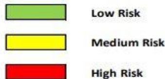
Table 5.3.1. Risk Matrix