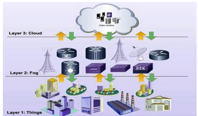
Fig -2: Fog Architecture

Fog computing consists of networking elements which acts