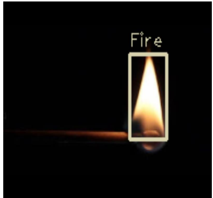
Fig 3: Fire detection as of input image