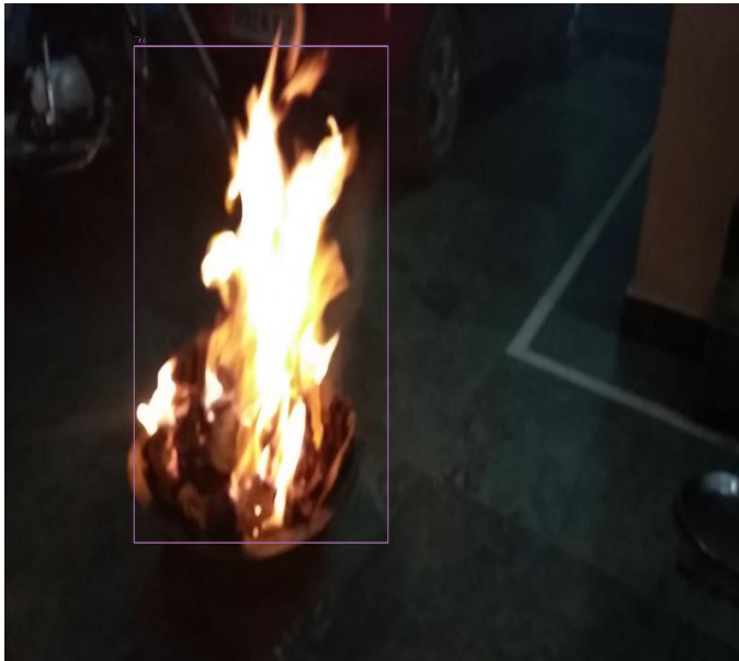
Fig4: Fire Detected as of input video