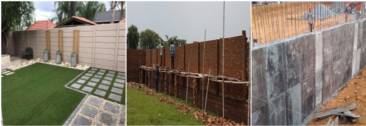
Prefabrication boundary wall. In-situ brick boundary wall. In-situ concrete boundary wall.