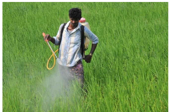
Fig -1: Traditional pesticide spraying.[7]

pesticide liquid without taking proper safety such a wearing mask and hand gloves. Many times, they inhale the pesticide while spraying it against the wind directions. The skin gets in a contact of pesticide; it leads to several problems as it would be absorbed into the body through pores. Farmers have to have lots of ailments like nausea, skin disorders and digestive problems and other.