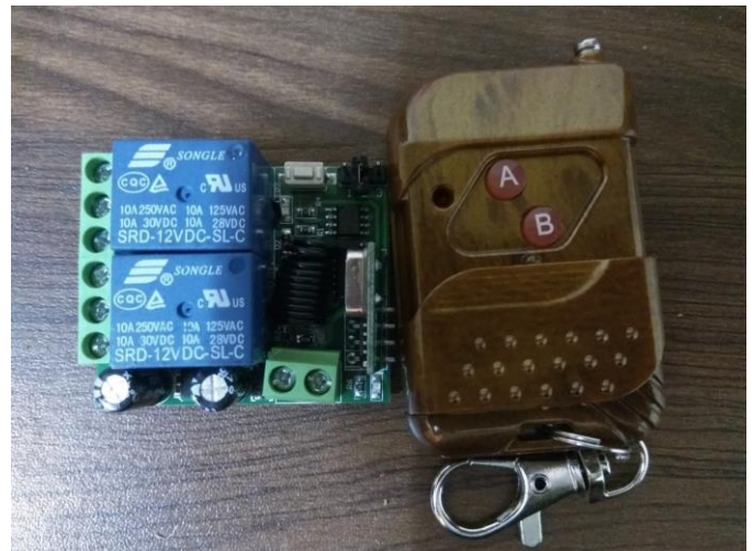
Fig -2: RF transmitter and receiver

Radio frequency (RF) module is a small electronics device used to transmit and receive the signals between to devices. In electronic system fixed system is required to communicate with another device wirelessly. In a RF circuit there are one transmitter and one receiver. RF circuit has wide range of applications. RF transmitter is a device which is used to transmit a required a signal to the receiver. It gives a signal to transmitter to perform required operations. They are available in different ranges and use as a system requirement. The transmitter used in this system has following specifications: