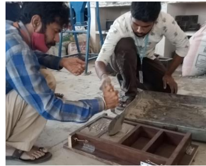
Fig 1 Making of geopolymer bricks

vibration. The sizes of the brick in the mould used here are 230mm x 110mm x 70mm.