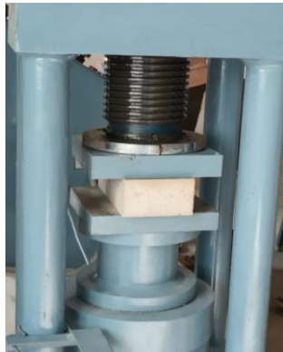
Fig 3 Compressive strength test on bricks

The compressive strength of geopolymer bricks with varying SSS/SHS ratio made with various mixes of sand and quarry dust are calculated as below.