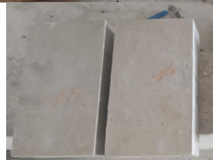
Fig 2 Casted bricks and air dried bricks