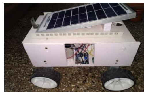
Fig -2: Rover with solar panel interfaced

The Rover is designed and is controlled using the RN 42 Bluetooth module and Android Application. The grass cutting machine is also implemented using the high-speed DC motor (5000 rpm) and motor speed controller module through which the speed of the motor/blade can be controlled using a knob.