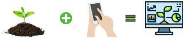
Fig. 2 How prediction helps farmers

technologies such as machinery, tools, and input information.