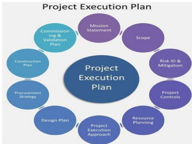
Fig: Project Execution plan

The major categories of plant leaf diseases are based on viral, fungal and bacteria. The diseases on leaves can reduce both the quality and quantity of crops and their further growth. The easy method to detect the plant diseases is with the help of agricultural experts having knowledge of plant diseases. But this manual detection of plant diseases takes a lot of time and is laborious work. Hence, there is a need for a machine learning method to detect leaf diseases. Computers can play a major role in developing the automatic methods for the detection and classification of leaf diseases. There can be various pattern recognition and image processing techniques that can be used in leaf disease detection. The leaf disease detection and classification of leaf diseases is the key to prevent agricultural loss. Different plant leaves bear different diseases. There are different types of methods and classifiers to detect plant leaf diseases.