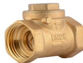
Fig -2: Non-return valve

It is one of the directional control valves. It will permit free flow only in one direction and reverse flow is not at all possible. It consists of a valve body poppet spring, and a valve seat. If the pressure falls in the inlet port the valve is closed both by the downward spring force and backpressure of the water outlet.