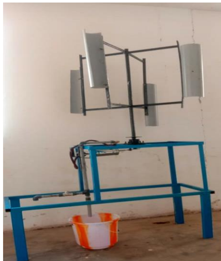
Fig -4: Final diagram