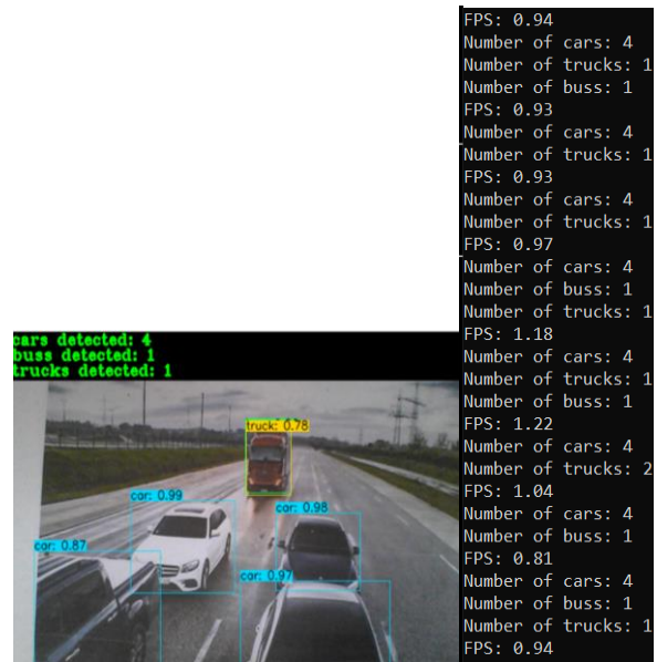
Fig no-3 Example of yolo algorithm output

After passing the image frame from yolo it gives output shown in Fig No-3.