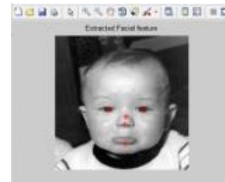
Figure 2. Locating key points