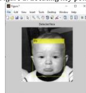
Figure 3. Emotion detection