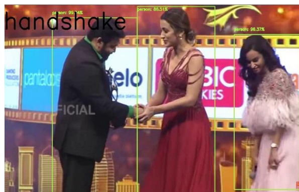
Fig-4: Output image