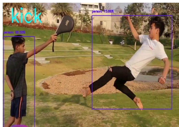
Fig-3: Output image