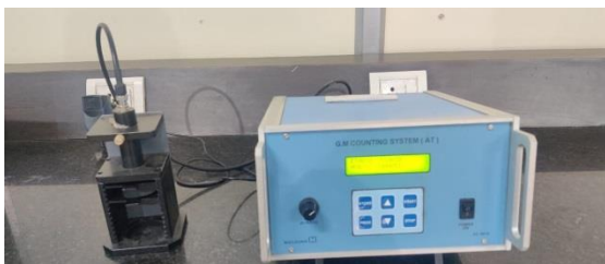
Fig- 2:GM Counter

GM counter was used for detection of alpha radiation, later various versions were introduced which could measure beta radiation and many other ionizing radiations. GM counter is a very good instrument for radiation detection because of its stable nature of operation [8]. And in this investigation the radiation source was not in high amount so GM counter was highly efficient for the experiment.