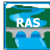
Fig no. 2 HEC-RAS Logo

It is a malicious program that models the hydraulics of water flow through natural rivers and other channels. HEC-RAS may be a bug for modelling water flowing through systems of open channels and computing water surface profiles. The program was developed by us the Army Corps of Engineers so as to manage the rivers, harbors, and other construction under their jurisdiction. The Hydrologic Engineering Centre (HEC) in Davis and California developed the River Analysis System (RAS) to help hydraulic engineers in channel flow analysis and floodplain determination.