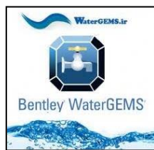
Fig no. 3 Water GEMS Logo

Bentley open flows Water GEMS provides a comprehensive and easy-to-use for water distribution networks. This software helps to boost the knowledge of how infrastructure behaves as a system, how it reacts to operational strategies and the way it should grow as population and demands increases. Open flows Water GEMS is that the hydraulic modelling application software for water distribution systems with advanced interoperability, asset management tools, geospatial model building and optimization. The users of this software enjoy the facility and flexibility afforded by working across CAD, GIS, and standalone platform while accessing one, shared, project data source. Water GEMS could be a superset of Water CAD so will get data as obtained from Water CAD plus more with Water GEMS.