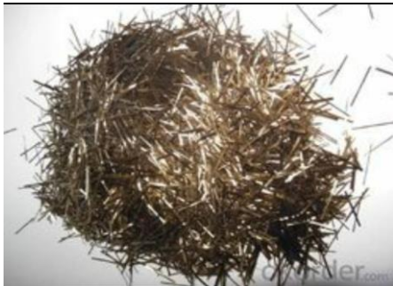
Fig-1. Basalt fiber

as an example . They will be used from very low temperatures (about -200 °C) up to high temperatures within the range of 700-800 °C, which makes them an outstanding economic alternative to other high-temperature-resistant fibers.