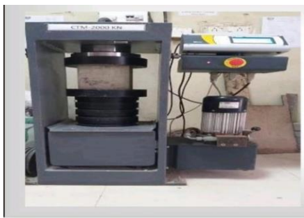
FIG-3.Universal testing machine

compressive strength test were administered and cubes of 150mm×150×150 cube size employing a UTM of 2000 KN capacity as per IS156:1959 The test concluded every 3 days, 14 days and 28days remove the specimen from curing tank and wipe out excess water from surface then put the specimen abroad base plate of the machine rotate the movable portion gently by hand in order that it touches the highest surface of the specimen abroad base plate of the machine. It touches the highest surface of the specimen applied the load gradually and Continuous apply till the specimen fails. Record the ulmost load minimum three specimens should be tested at each selected day.