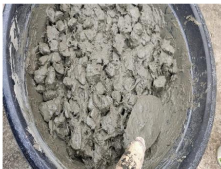
Fig-2. Basalt fiber mix in concrete.