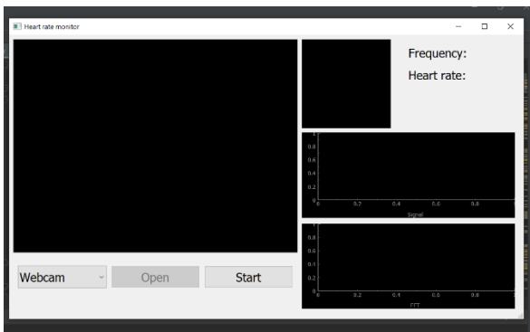
Fig 4.1 : Sample Screen 1

At the beginning, our system looks like,