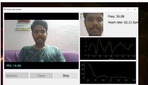
Fig 4.2 : Sample Screen 2

It will show your Heart rate, pulse Peak graph, fps count on separate screen.